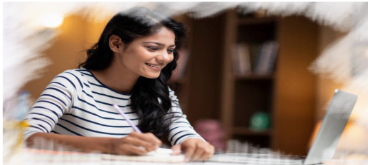
Online Pre-recorded Classes